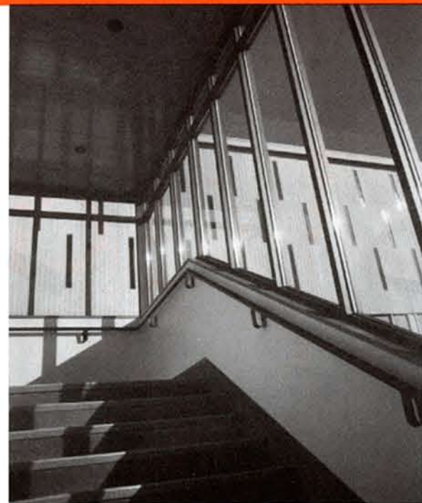
West elevation, Fred Housel. Detail of interior stair, Chris Serra. Left, 2nd floor plan with pre-existing conditions in grey.